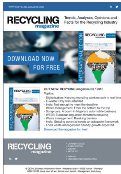
International newsletter Frequency: monthly